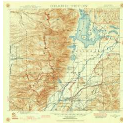
GRAND TETON VINTAGE MAP