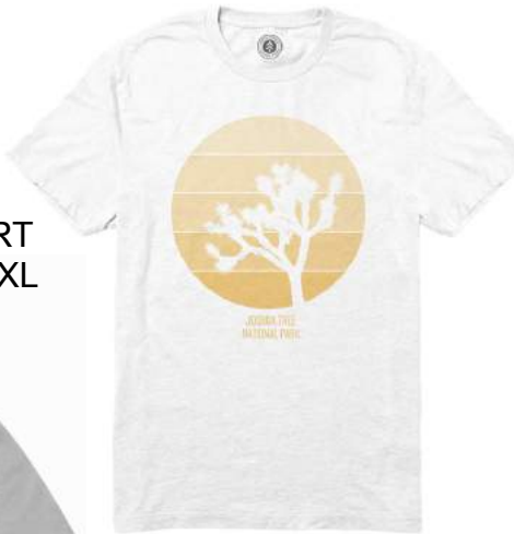
JOSHUA TREE BAR SUN T-SHIRT $36 – 100% Cotton, S-XL White