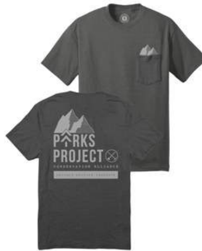
CONSERVATION ALLIANCE T-SHIRT $36 – 100% Cotton, S-XL Charcoal