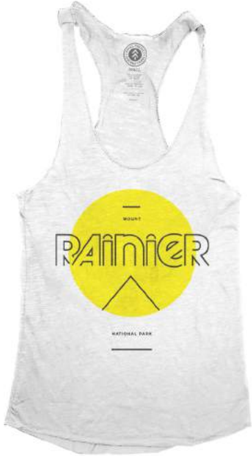
RAINIER MOD SUN RACERBACK TANK $34 – 100% Cotton, XS-L White