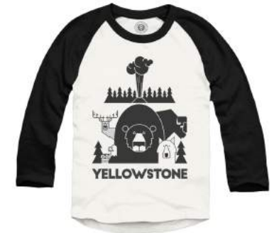
YELLOWSTONE KIDS RAGLAN $40 – Poly/Cotton Sizes 2,4,6