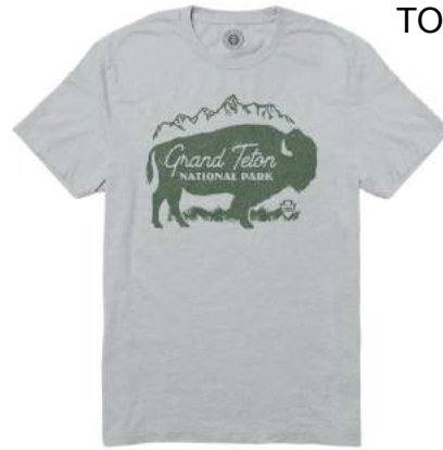
GRAND TETONS BUFFALO T-SHIRT $36 – Poly/Cotton Blend, S-XL Heather Grey