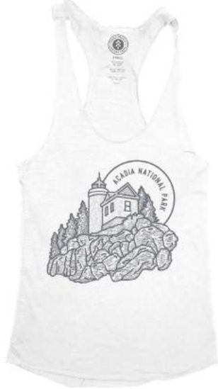
ACADIA LIGHTHOUSE RACERBACK TANK $34 – 100% Cotton, XS-L White