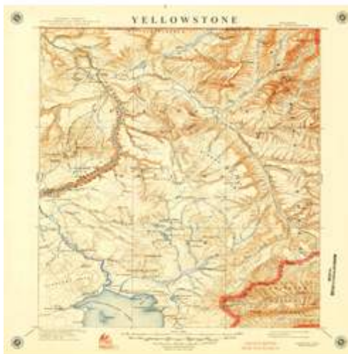
YELLOWSTONE VINTAGE MAP