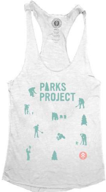
RESTORATION NATION RACERBACK TANK $34 – 100% Cotton, XS-L White