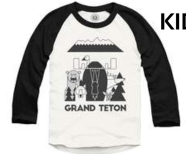
GRAND TETON KIDS RAGLAN $40 – Poly/Cotton Sizes 2,4,6