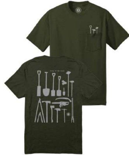
TOOLS OF THE TRADE T-SHIRT $36 – 100% Cotton, S-XL Olive