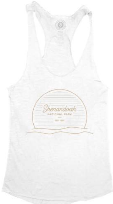
SHENANDOAH SUNSET RACERBACK TANK $34 – 100% Cotton, XS-L White