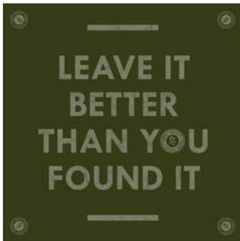
LEAVE IT BETTER