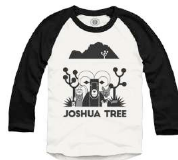
JOSHUA TREE KIDS RAGLAN $40 – Poly/Cotton Sizes 2,4,6