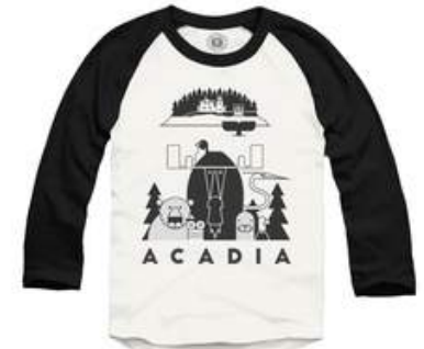
ACADIA KIDS RAGLAN $40 – Poly/Cotton Sizes 2,4,6