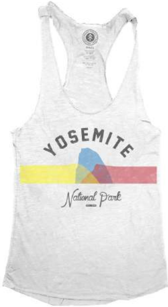
YOSEMITE COLOR BLOCK RACERBACK TANK $34– 100% Cotton, XS-L White