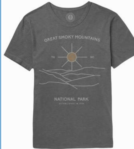
GREAT SMOKY COMPASS T-SHIRT $36 – 100% Cotton, S-XL Heather Grey