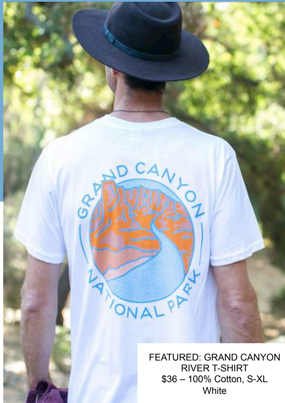
FEATURED: GRAND CANYON RIVER T-SHIRT $36 – 100% Cotton, S-XL White