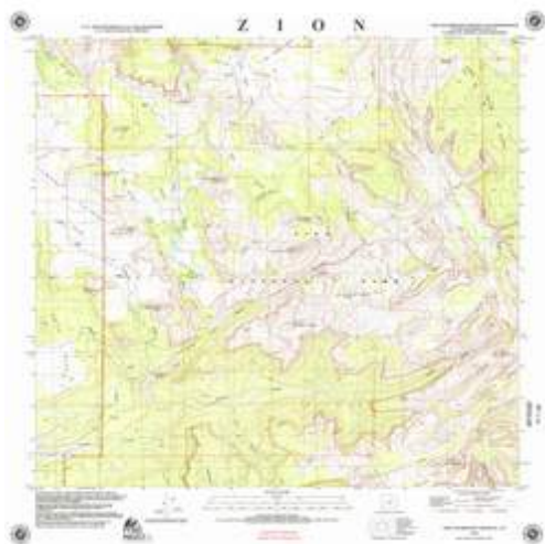
ZION VINTAGE MAP