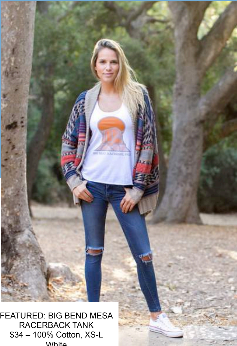
FEATURED: BIG BEND MESA RACERBACK TANK $34 – 100% Cotton, XS-L White