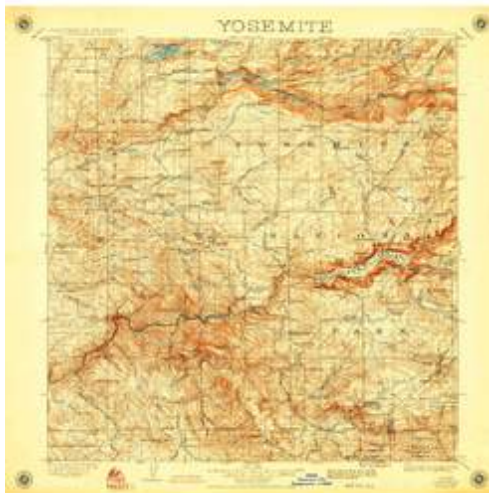
YOSEMITE VINTAGE MAP