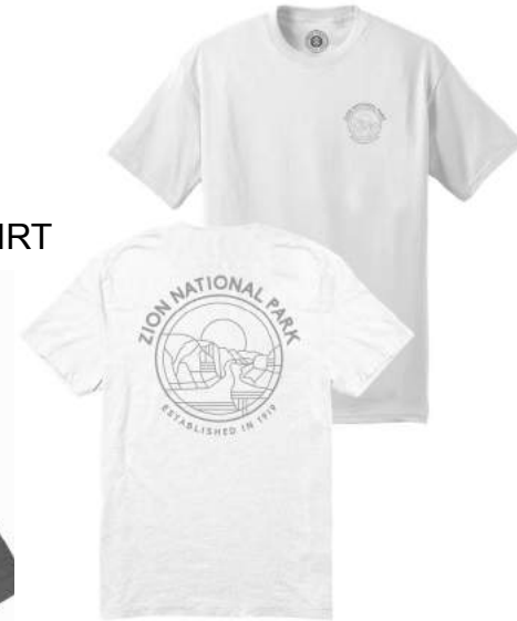
ZION OUTLINES T-SHIRT $36 – 100% Cotton, S-XL White