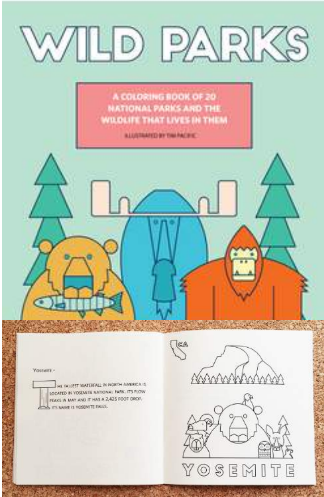
WILDS PARKS COLORING BOOK $16 – 40 Pages