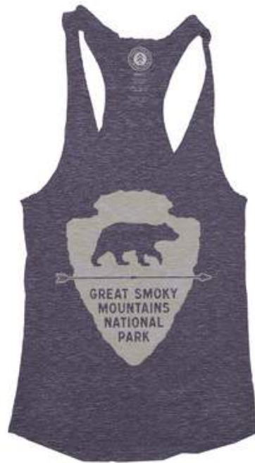
GREAT SMOKY ARROW BEAR RACERBACK TANK $34 – Poly/Cotton Blend, XS-L Heather Black