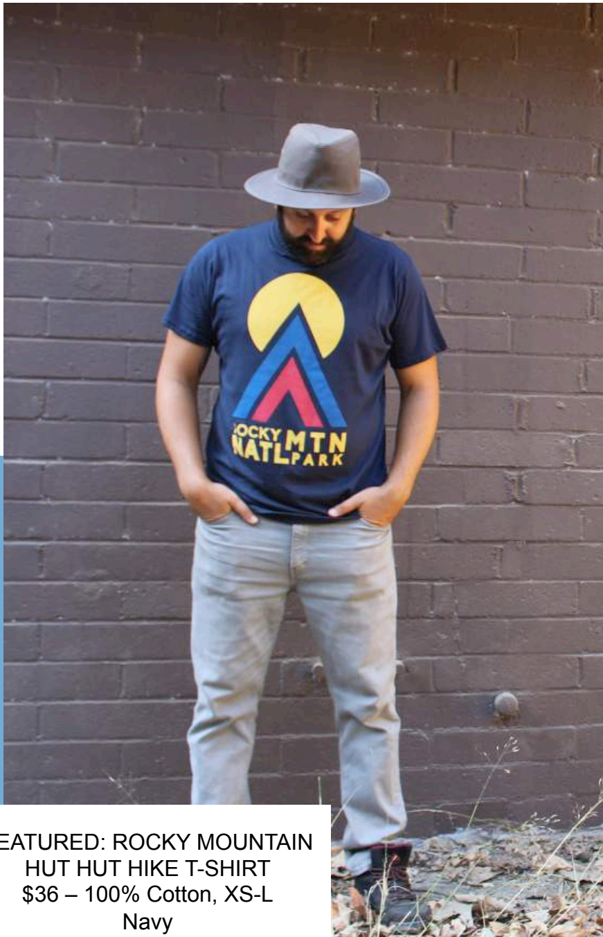
FEATURED: ROCKY MOUNTAIN HUT HUT HIKE T-SHIRT $36 – 100% Cotton, XS-L Navy