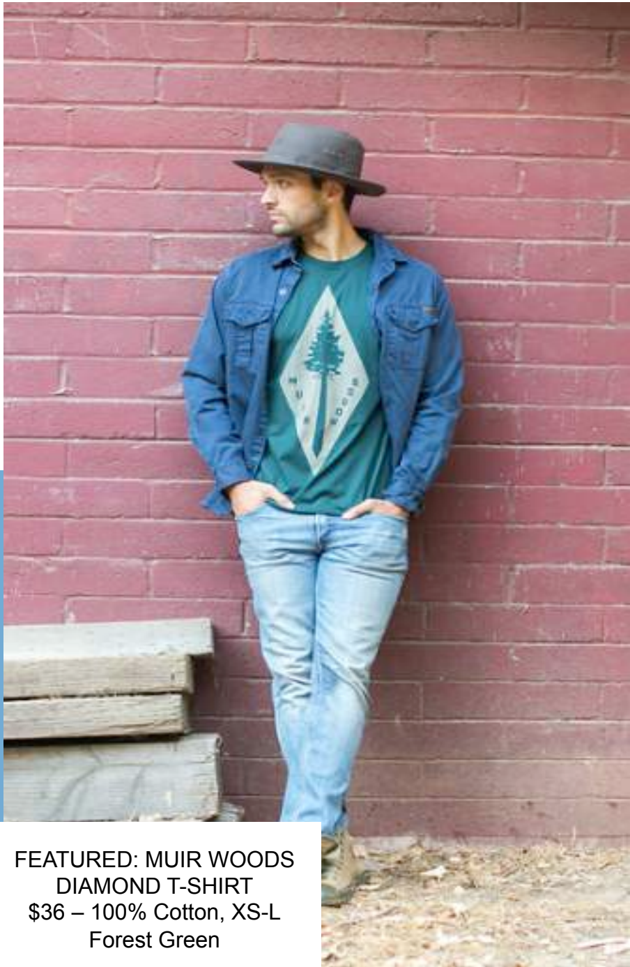
FEATURED: MUIR WOODS DIAMOND T-SHIRT $36 – 100% Cotton, XS-L Forest Green