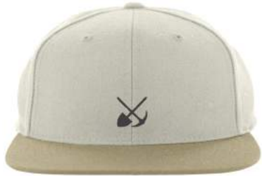
MINI AXE/SHOVEL HAT $32- Canvas, One Size Natural