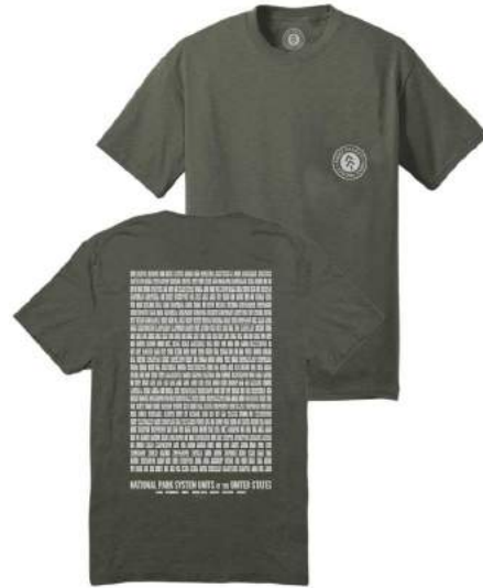
AROUND THE PARK T-SHIRT $36 – 100% Cotton, S-XL Charcoal