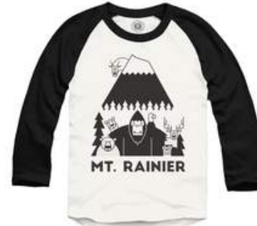
RAINIER KIDS RAGLAN $40 – Poly/Cotton Sizes 2,4,6