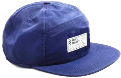
NUEVO FORRAGER HAT $32- 100% Nylon, One Size Navy