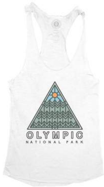
OLYMPIC PYRAMID RACERBACK TANK $34 – 100% Cotton, XS-L White