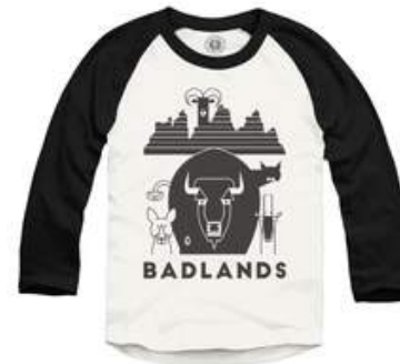
BADLANDS KIDS RAGLAN $40 – Poly/Cotton Sizes 2,4,6