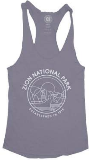
ZION OUTLINES RACERBACK TANK $34 – 100% Cotton, XS-L Charcoal