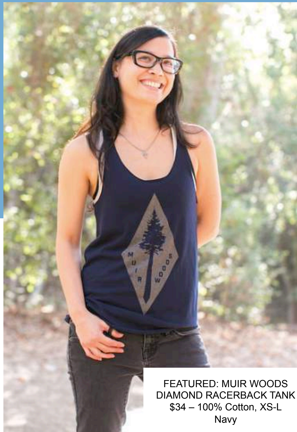
FEATURED: MUIR WOODS DIAMOND RACERBACK TANK $34 – 100% Cotton, XS-L Navy