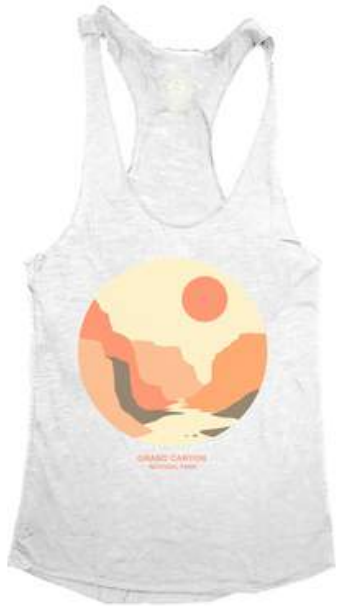
GRAND CANYON SILHOUETTE RACERBACK TANK $34 – 100% Cotton, XS-L White