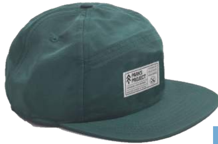
NUEVO FORRAGER HAT $32- 100% Nylon, One Size