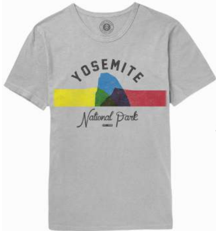
YOSEMITE COLOR BAR T-SHIRT $36 – Poly/Cotton Blend, S-XL Heather Grey