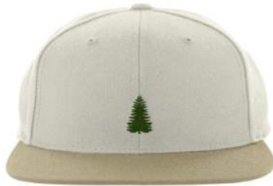
MINI TREE HAT $32- Canvas, One Size Natural