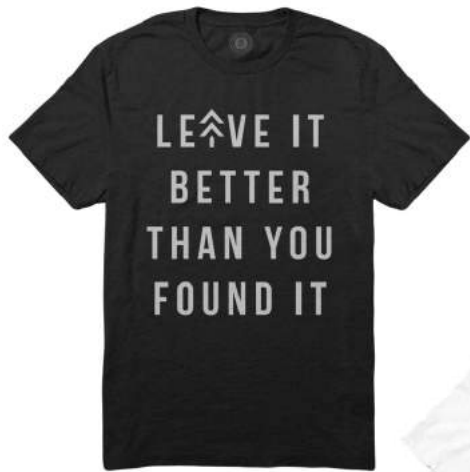
LEAVE IT SLIM T-SHIRT $36 – 100% Cotton, S-XL Black